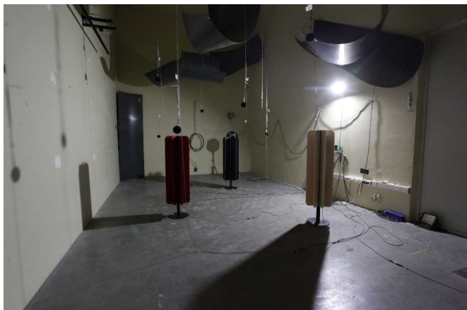
picture : test-setup 1