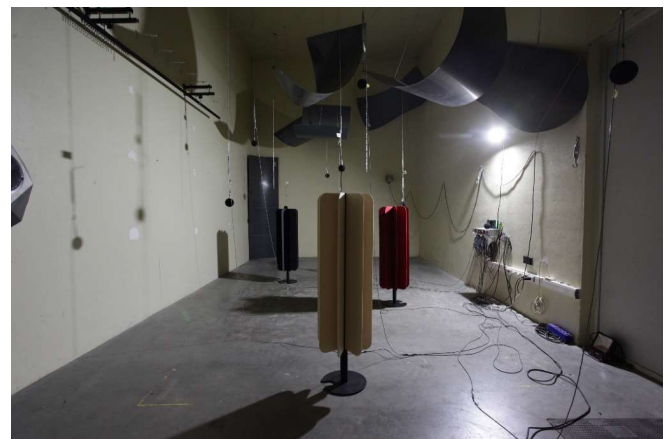
picture : test-setup 2